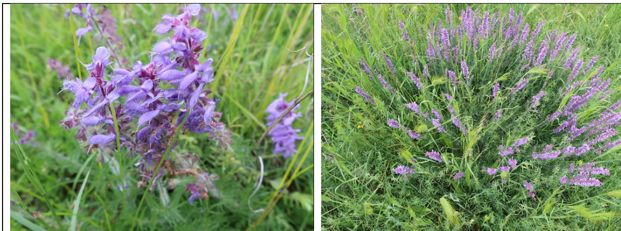
Salvia jurisicii Kusanin

The Second Circular with information on deadlines, fees, etc. will be posted soon.