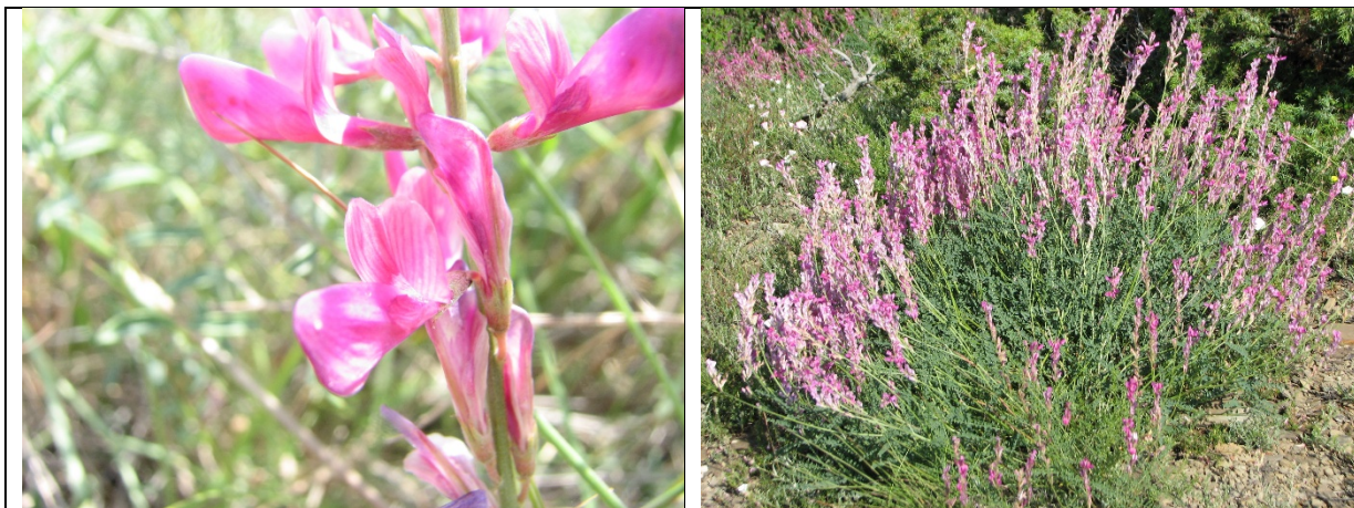
Hedysarum macedonicum Bornm.